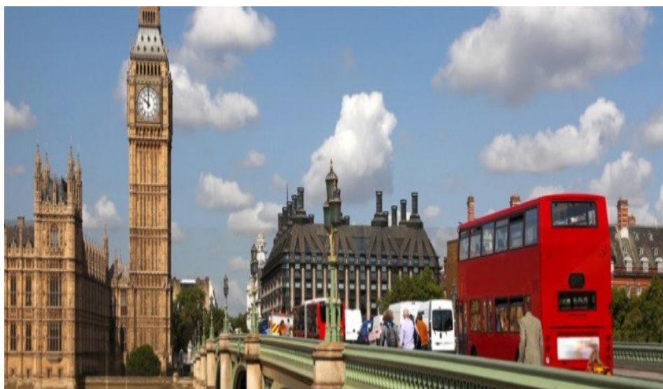
The Elizabeth Tower also known as "Big Ben" and the London Bridge.

We believe this trip provides a unique opportunity for our students that they wouldn't get at other universities. It will also provide an opportunity for alumni to learn the differences and similarities in health care delivery in one of the world's fastest growing economies.