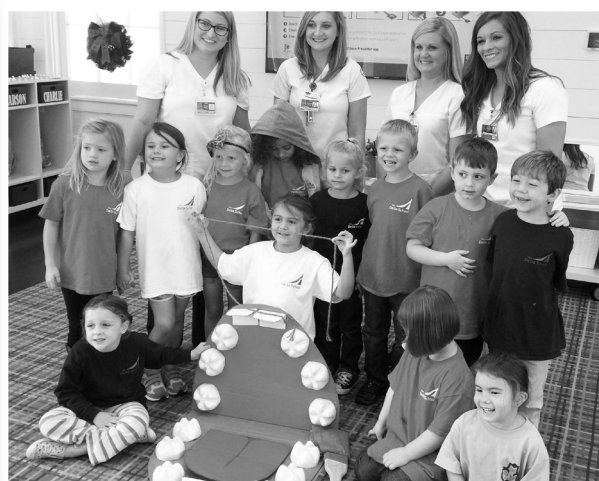
AASN students participated in a community teaching project at Delta School in Wilson, AR on Oct. 28, 2016.