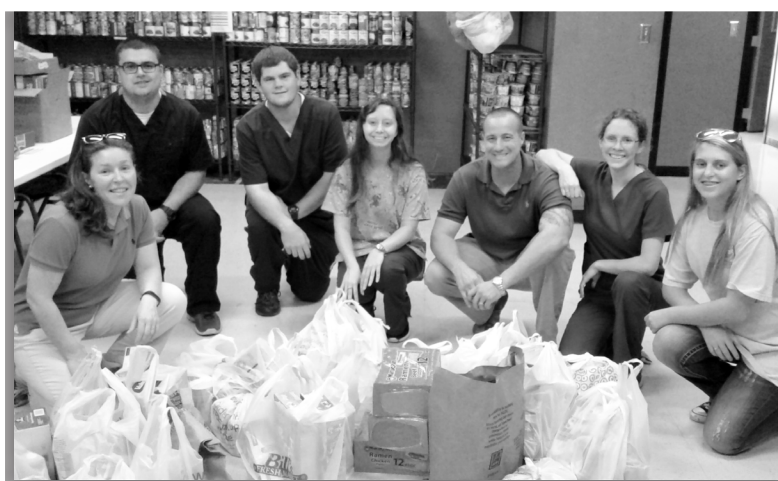
For the 10th anniversary of the PTA program, the department held a CE seminar on Oct. 15. Students also collected 245.2 pounds of food for the campus food pantry.

The conference offered dynamic presentations on health disparities, well initiatives and innovative prevention strategies for communities at risk in the Delta Region. Faculty from many programs in the college made presentations. All workshop/presentations incorporated best practice information and engaged groups in interaction and discussion. The conference forum also includes a